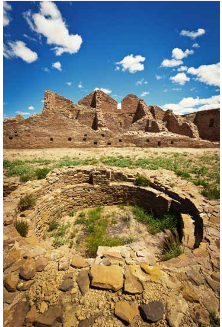
Photo: The Kiva, a spiritual site in The Chaco Culture National Historical Park. Istockphoto

Though led by our Indigenous allies, we can be proud of the role the Sierra Club played in this campaign and win. Sierra Club organizers and the Rio Grande Chapter worked with activists in New Mexico, and even flew activists to lobby the DOI, EPA, and Congress in support of legislation and administrative action to protect the Greater Chaco Canyon ecosystem from drilling and development.