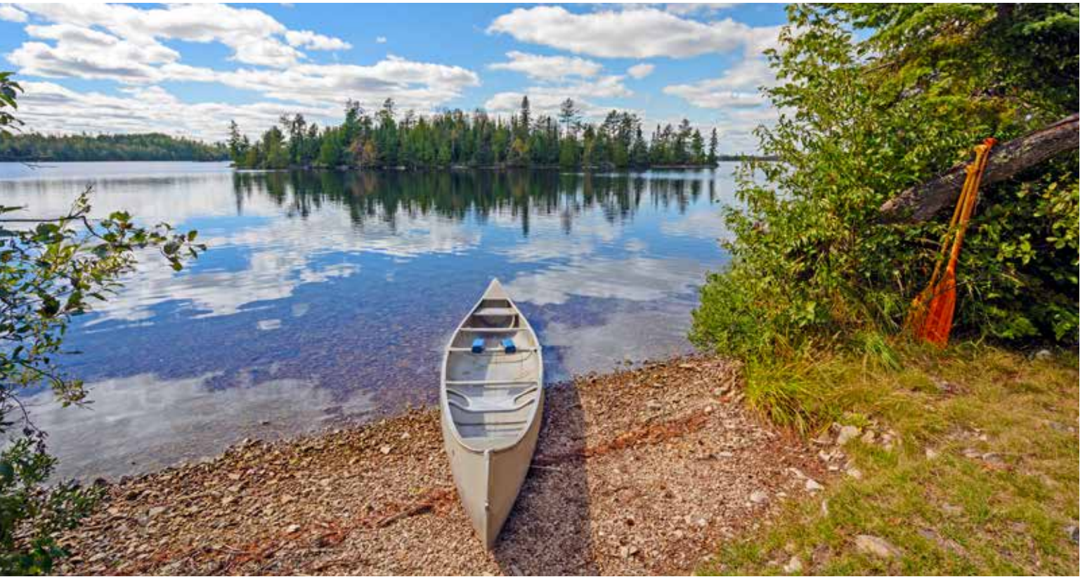
Photo: Kekekabic Lake in Minnesota's Boundary Waters.