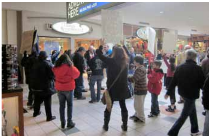
Round Dance Flash Mob event for Idle No More at Racine Regency Mall

I participated in the Racine Round Dance Flash Mob on February 17. The focus was on the mining bill and the effects