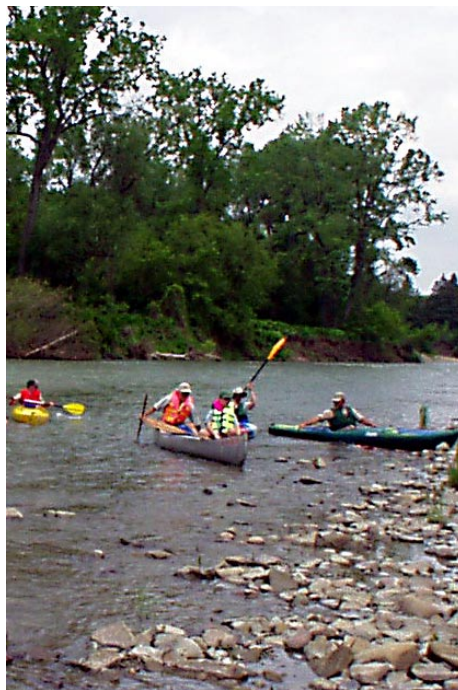
Rediscovering the Genesee River south of Fildore, Allegany County June 2003