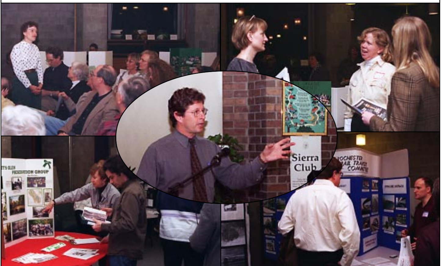
Scenes from the Environmental Forum, April 6, 2000