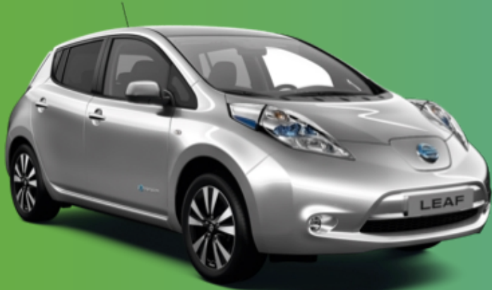
NISSAN LEAF 150 mile range