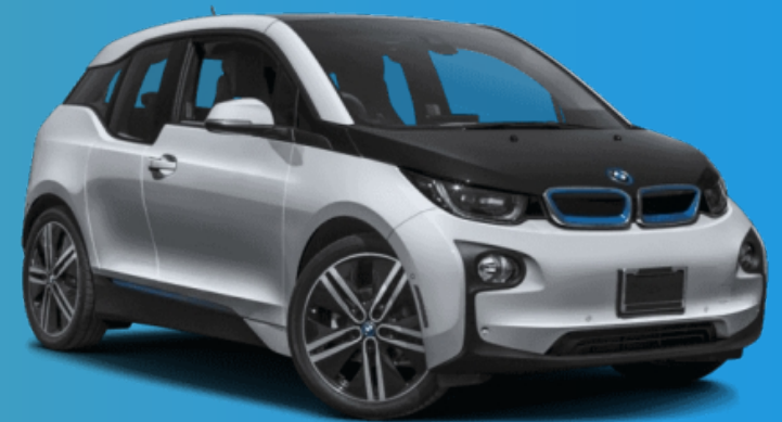
BMW i3 114 + 70 mile range

Learn more about these cars: http://www.ez-ev.com/sierra