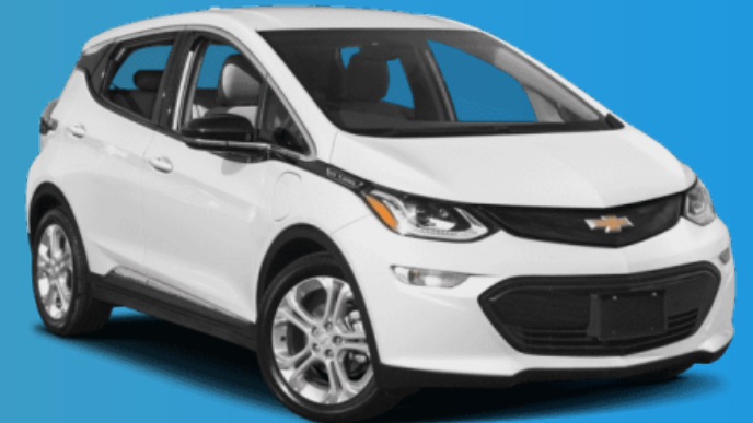
Chevy Bolt 238 mile range