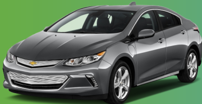
Chevy Volt 53 + 367 mile range