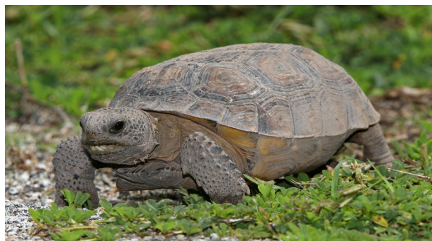
Gopher tortoise, courtesy of Wikipedia

Conservation Commission is significant for insight into the importance of this species.