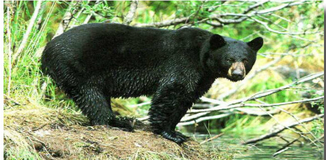
Black bear

Her recent work as project manager on a Gopher Tortoise Payment Ecosystem Services Program for the Florida Fish and Wildlife