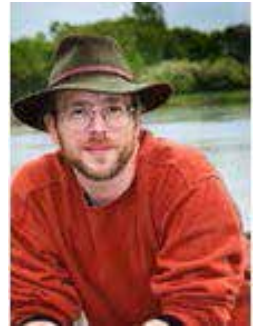
By Jay Schlegel

organization's product: the November issue of National Geographic magazine is dedicated exclusively to climate change. You can view it online at http://www.nationalgeographic.com/climate-change/special-issue/ . Perhaps we don't all agree on the causes or the solutions, but I do think that such a communication effort is laudable as well as effective. Please read it, and share it with your family and friends if you like.