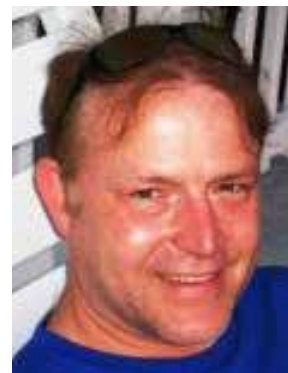
By James D'Amour

However, by the time this article is printed, we could see a city-approved petition seeing over 500 new homes on the former Nixon farms, built over seven years, with an additional proposal of 250 apartments built over on the other side of Nixon road on the east, each development abutting US-23 at the Nixon Road overpass.