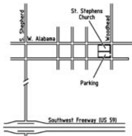
MAP: GETTING TO THE GENERAL MEETING