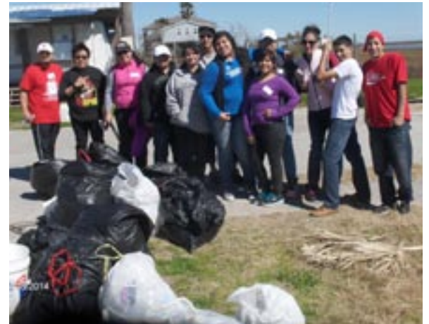
ICo Participants and collected trash