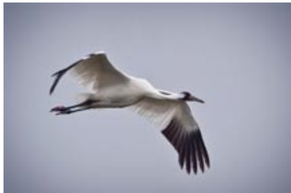
Whooping Crane flying

April 16, 2014 May 21, 2014 6:30 -9:00 PM