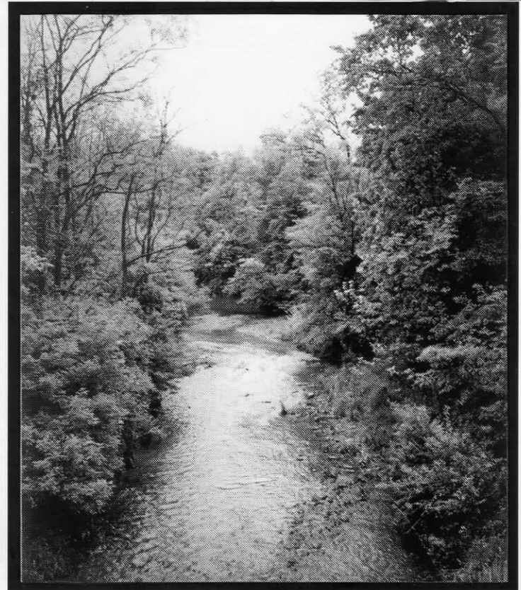
Lick Creek running through Pekin's McNaughton Park. The City of Pekin's proposed sewer line would cross under Lick Creek six times.