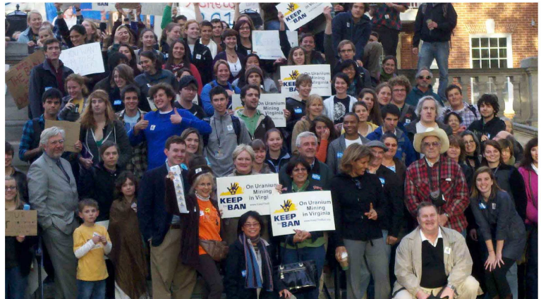
Keep The Ban Rally @ the University of Mary Washington