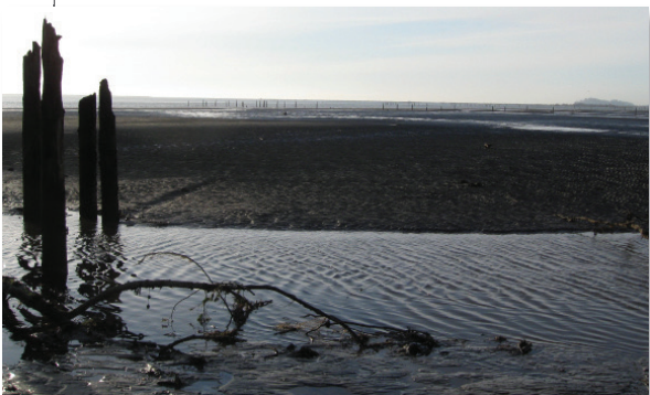
Columbia River Estuary