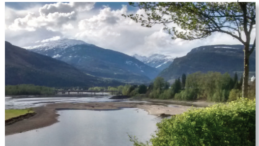
Columbia River at Revelstoke, BC

The Sierra Club has extended its COVID-19 operational response through Sunday, July 4, 2021. This means all national, chapter, and shared offices will remain closed, with rare exceptions for urgent business.