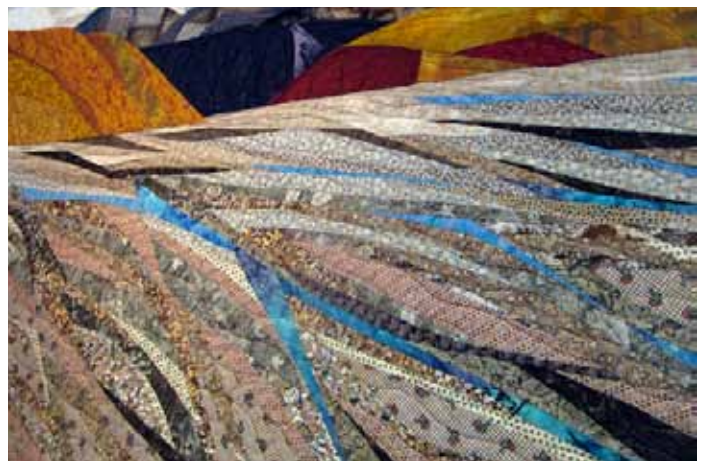
Detail of one of the striking works of art in Voices of the Wilderness , the 50th anniversary Wilderness art show travelling through Alaska. This is from Linda Beach's "Threading Through the Gravel Bars, East Fork of the Toklat".