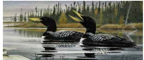
Yellow-billed loon