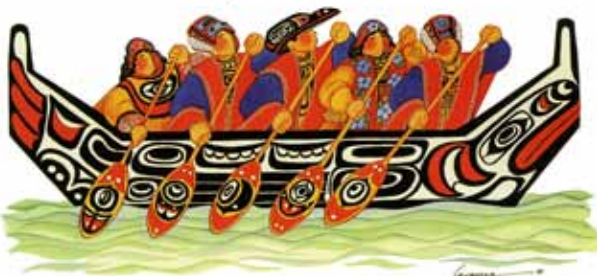
"Tlingit canoe" © Barbara Lavallee

Begich (D-AK), passed Congress with no recorded votes, ending more than a decade-long campaign by the cultural anthropologists and managers at the park to open the park to egg collecting.