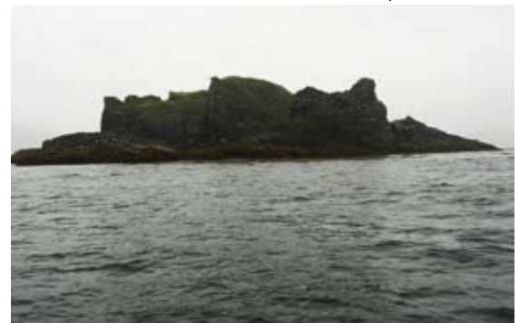
Table Rock in Cross Sound is one of the five other non-park sites. The photo was taken about two weeks after the nesting season ended; large numbers of glaucous-winged gulls are present during the nesting season.

The availability of the six non-park sites for HIA gull egg collecting is the alternative to S. 156 that the Sierra Club recommended to the Committee and now recommends to the full Senate.