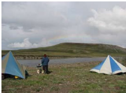
Onshore in the Western Arctic, camping at the Kokolik River