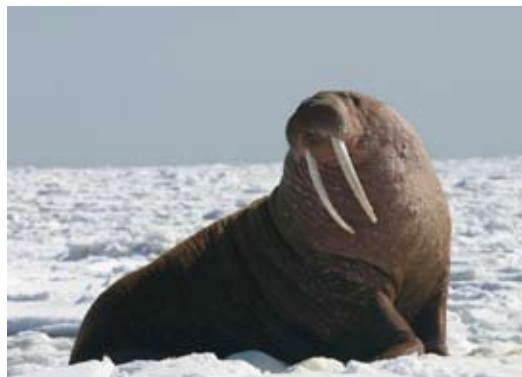
Offshore: walrus and other marine wildlife at risk

The ever-changing Arctic had a busy year in 2012, and still faces ever more challenges to come. Summer of 2012 saw the smallest amount of sea ice ever. Also during summer of 2012, Shell Oil brought two drill rigs into the Arctic Ocean; other shipping traffic increased as well, taking advantage of ice free waters. While the coastal seas were seeing so much potentially damaging activity, hope increased that onshore the public lands in the Arctic – both the Arctic National Wildlife Refuge and the Western Arctic (NPR-A) -- might see the most protections in decades. Let's