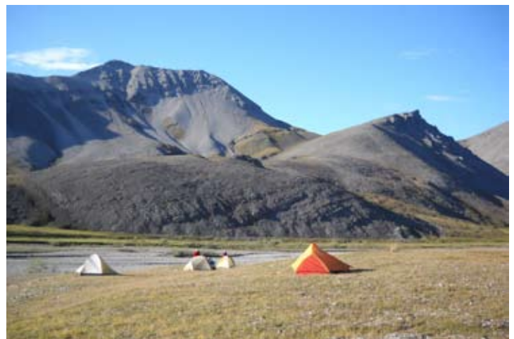
Tents on the tundra--western Arctic

My 2012 trip is entitled "Foliage, Fish, and Berries in the Western Brooks Range". This is its third year and follows a number of earlier trips in the same general area. Our timing coincides with the peak of the tundra fall foliage when the dwarf birch forming the basic fabric of the shrub tundra turns a blazing orange-red. The colorful tundra mosaic is dotted with alleys of yellow willow in the drainages and patches of deep red and purple where blueberry and bearberry hold forth on the drier slopes. These hues are offset by the silvery gray of frost-shattered rock outcrops. The jagged peaks and rocky spires lining ridges often remind the viewer of a stegosaurus backbone. This is the unexpected result of the arctic climate, where the most recent glacial advances could not