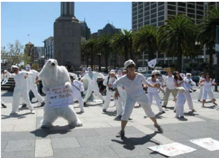
San Francisco polar bear dance party -- on the Embarcadero, April 28, 2012