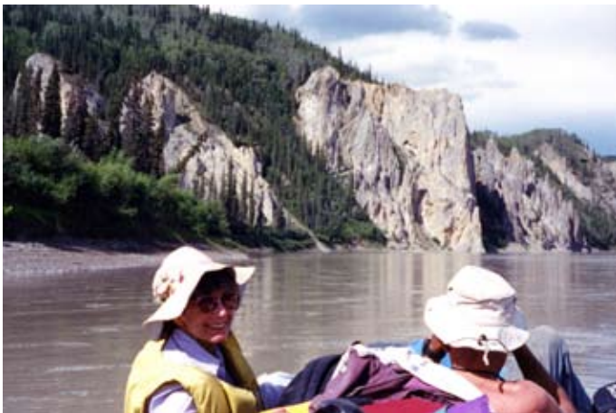
A 2002 Alaska Chapter outing rafts the Yukon River in Yukon-Charley National Preserve; passing Tahoma Bluffs