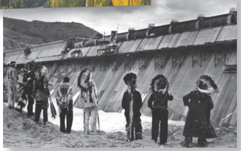
Traditional Chiefs of the Colville Indian Reservation in 1941 gather to witness the completion of Grand Coulee Dam. The Columbia River Pastoral Letter is a foundation for efforts to right historic wrongs of the dam-building era, including restoring fish passage at Grand Coulee Dam.

focus, the document has direct relevance to rivers and aquifers globally. Just as Judeo-Christian principles have contributed