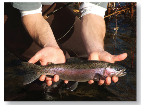
Spokane River redband trout. PCBs accumulate in the food chain, including fish and humans. Health advisories about PCBs contaminating fish are posted along the Spokane River.