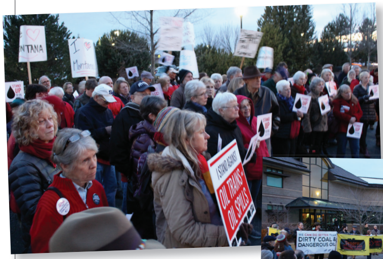
On January 14th, over 500 people gathered in Spokane Valley to stand up to what would be the largest oil terminal on the continent in Vancouver, WA. With the help of the Sierra Club, 276,296 comments were delivered in opposition to this project. If built, 360,000 barrels of explosive oil would be shipped through our communities every day!

COAL IS AN OUTDATED, BACKWARD, AND DIRTY 19TH-CENTURY TECHNOLOGY. WE NEED YOUR HELP TO MOVE OUR REGION BEYOND COAL!