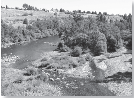
Spokane River, low flows. The stretch of river in the West Central Neighborhood is an important reach for recreation and redband trout. The Washington Department of Ecology flow rule threatens to further dewater the Spokane River. PHOTO: John Osborn, 9-3-2003.

The only entities that will benefit from the new rule are out-of-stream water users. As documented in