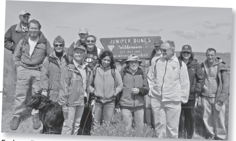
Explore - Enjoy - Protect. In April, local family farmers led us on a magical hike in the Juniper Dunes Wilderness, and then nearby to Easterday's new 30,000 cattle "finishing" feedlot supplying Tyson's slaughterhouse near Pasco. A loophole allows industrial stock operations to pump vast volumes of ancient groundwater, threatening the family farmers' domestic wells.

THURSDAY, AUGUST 1 (6pm) DISHMAN HILLS CONSERVATION AREA - GLENROSE This hike will focus on the Glenrose area about 2 miles east of Ferris High School – wildlands protected in 2012 using Conservation Futures funds. The hike is easy to access from the urban South Hill