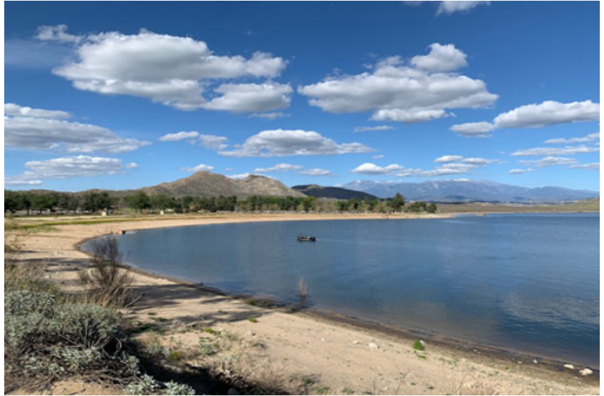
Lake Perris, March 8, 2020

Villages of Lakeview (VOL): This master planned community with its 8,725 dwelling units development on the south edge of the San Jacinto Wildlife Area, was approved by the Riverside County Board of Supervisors this past spring. A coalition of environmental groups represented by the Center for Biological Diversity has challenged this project