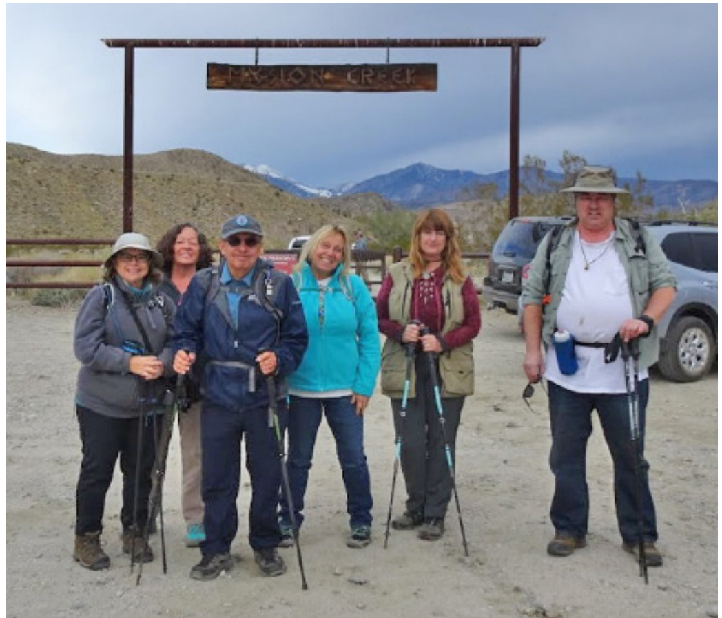
Mission Creek Preserve Hike, Moreno Valley Group, January 2020

Moreno Valley General Plan Update (MVGPU): Changing Land Uses & Policies: Our city has begun the process of updating its current general plan and land use map. The last update, approved in 2006, took five years for it to be