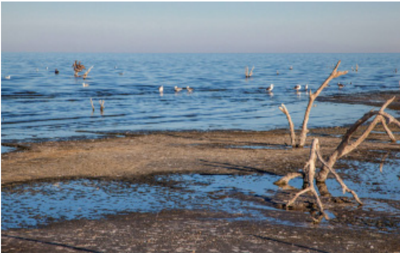
Dust obscures the mountains in the distance as migratory birds stop at the Sea.

pandemic, the Newsom administration cannot forget that the Salton Sea is part of the equation. The state continues to lag behind in its efforts to complete projects on the ground that will address longstanding public health concerns, such as dust suppression projects. In the coming weeks the Sierra Club will maintain pressure on the State to make sure they keep their foot on the accelerator to remediate the Salton Sea. For now, we are working with our partners in the East Coachella Valley to make it clear to all that Covid-19 is not the “great equalizer” that some have suggested. The Covid-19 pandemic adds terrible health risks to communities already struggling from the results of decades of inaction on addressing the public health crisis at the Sea.