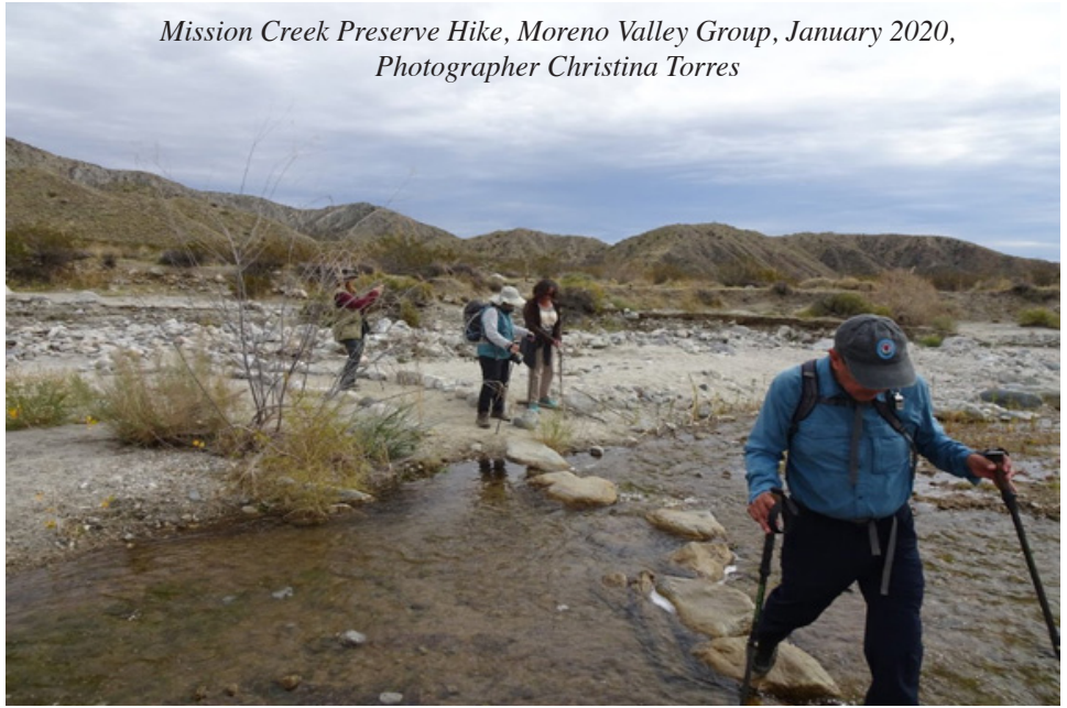
Mission Creek Preserve Hike, Moreno Valley Group, January 2020

Amendment and a Change of Zone from “Residential: Max 2 du/ac (R2)” to “Business Park/Light Industrial (BP)” and “Residential Agriculture, 2 du/ac (RA2)” and “Primary Animal Keeping Overlay Zone (PAKO)” to “Light Industrial (LI)” respectively. The City has issued the Notice of Preparation (NOP) to provide responsible agencies and other interested parties with information describing the proposed project and its potential environmental effects with an opportunity to provide comments on the preparation of an Environment Impact Report by April 14, 2020.