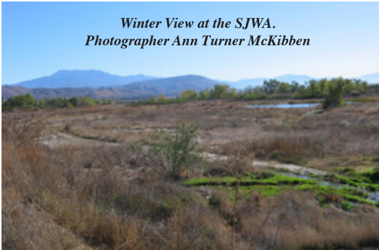
Winter View at the SJWA.

designated Business Park uses for the undeveloped land but did not include the 10-acre MVBP site. Subsequently, the developer chose to build four small warehouses totaling more than 400,000 sq. ft. When that project processed through its approval process the titled "Business Park" designation mislead the surrounding property owners and others who thought the proposal would include commercial business, service centers, and offices. Unfortunately, the city permitted the development of a cluster of small warehouses in a prime commercial and residential area.