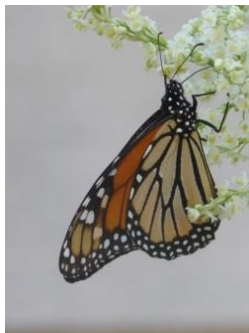
Our photo of the one butterfly we saw

My wife and I recently went on a trip visiting family and being tourists to Virginia, Maryland and Washington DC. Amongst other things, we visited the National Botanic Garden in Washington DC, hiked part of the Appalachian Trail, and did a second hike off the Skyline Drive through the Smokey Mountains. In addition, we visited several nurseries and other gardens and parks. With this kind of information in mind, how many monarch butterflies did we see at a time of the year when populations should be approaching maximum in preparation for the annual migration? Exactly one Monarch Butterfly! For one of the most unique, iconic and beautiful insects, Monarch butterflies have now suffered four different assaults on their very existence. This is incredibly sad. Of course, people concerned about the loss of such a magnificent species advocate serious pesticide restrictions, butterfly gardens, and Monarch way-stations to aid their migration. Let's hope mankind realizes what is happening and can prevent the loss of this beautiful creature. Otherwise these kind of actions amount to using just one bucket to bail water when the Titanic is slowly going down.