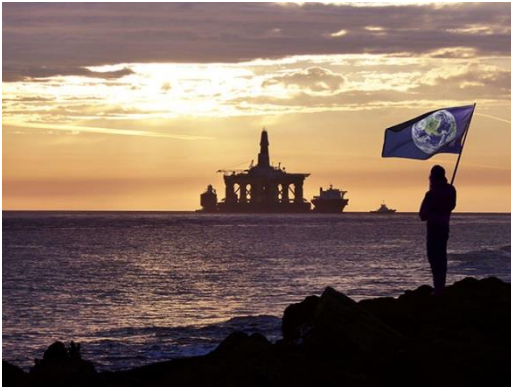
Digital Image by Dianna Sarto