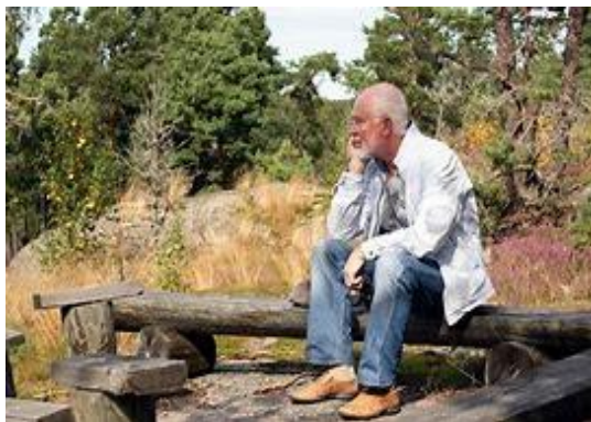
Summer, after all, is a time when wonderful things can happen to quiet people.