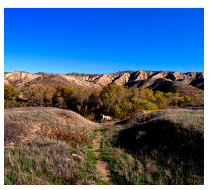
San Timoteo Canyon

Saturday, November 16th, at 7:00 AM This is an easy, family-friendly 5-mile out and back trail through the San Timoteo Nature Sanctuary. The trail is mostly flat, only gaining 300 ft. over the course of 5 miles. We will take advantage of the cooler weather and watch as seasons change in our local foothills. LEVEL: EASY Leader - Rachel Wilkins