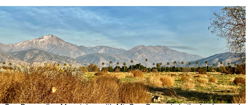
San Bernardino Mountains, with Mt. San Gorgonio in the background

Sierra Club San Gorgonio Chapter P. O. Box 5425, Riverside, CA 92517-5425