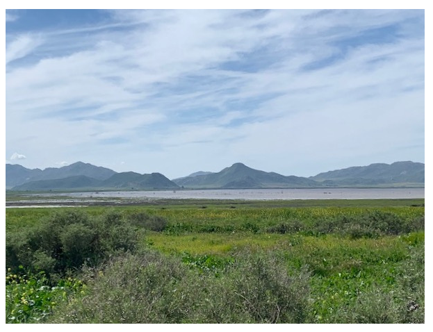
April 2023 Mystic Lake, SJWA

Twenty years ago the Moreno Valley Group and the SBVAS were represented in litigation by the Center for Biological Diversity (CBD) and we won. Anothe version of the VOL was approved in 2017 and our same groups challenged it again and while we lost in the Superior Court we won at the Court of Appeal in 2023.