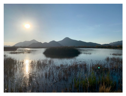
San Jacinto WIIdlife Area

After our 20 years of campaign and litigation with this massive project we have reached a settlement that eliminates all housing adjacent to the SJWA and has permanent agriculture in their place - more than 230 acres. This also resulted in at least 2,600 fewer units with their possible pets impacting the SJWA.