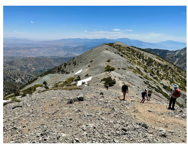
Devil's Backbone, Mt. Baldy

Join us for this interactive and informative update via zoom. Register on our website calendar to receive the Zoom link. Our trail Talks are recorded and available to watch on our <a href="YouTube channel">YouTube channel</a> at your convenience!