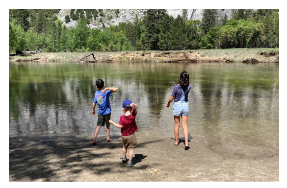
For Their Future!

Become a Monthly Donor! Check "make my gift monthly" with your next donation. Consider $5, $10, $20 or more a month - it all helps!