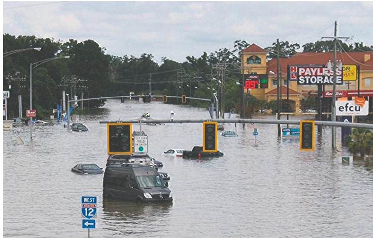
LA DEPT OF TRANSPORTATION

The failure of our politicians to acknowledge the problem inhibits the discussion of strategies for adapting to what the science tells us is coming. Our politician, who espouse small government and