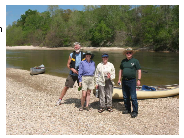
Honey Islanders at 2011 Chapter Retreat.

Accomodations: Cabin spaces are available for $45 per person for the two nights, both Friday and Saturday. The contact person for booking your reservation is Diane Casteel, email 999diane@gmail.com. Contact her for reservation availability as soon as you can but no later than Feb 29. We have reserved four cabins this year. Each cabin sleeps up to 8 people with 1 double bed, 2