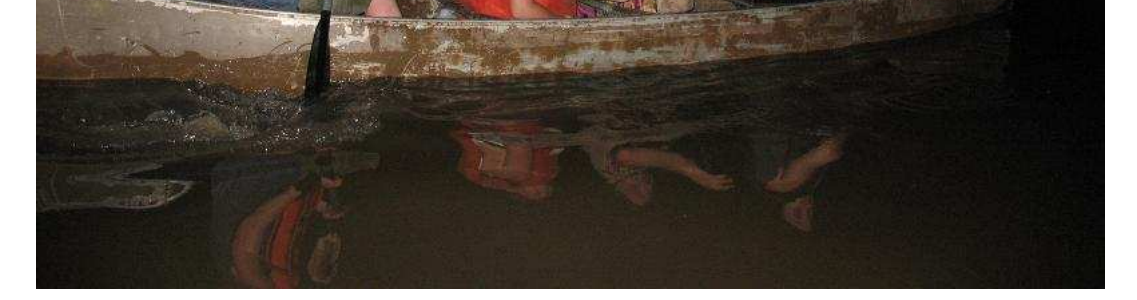
Acadian Group members in the moonlight on Bayou Teche