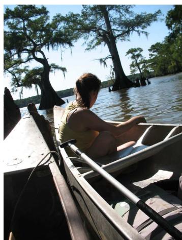
Acadian group on the water

It is our hope that by enforcing this powerful piece of legislation, we can create a space where citizens and the state government can work together to improve and protect some of our most important waterways.