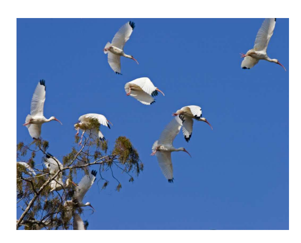
White Ibis on Bayou Sorrel

to your local Chapters work in your state. This donation is not tax deductable as it supports our organizational and lobbying work. You can make tax deductable donations and bequests to the Delta Chapter in care of the Sierra Club Foundation to support our conservation work, contact <a href="mailto:hrmartin2sc@gmail.com">hrmartin2sc@gmail.com</a> for more information.