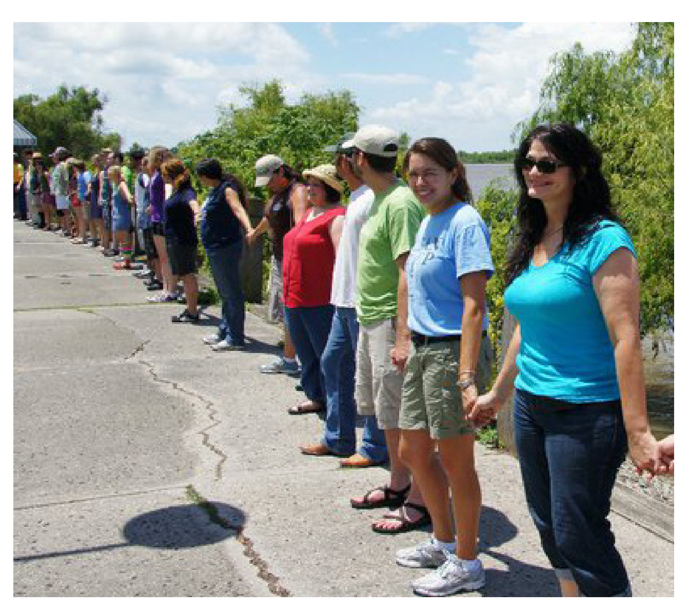
New Orleans residents come out for Hands Across the Sand Event in New Orlenas