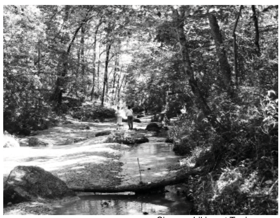
Sierrans hiking at Tunica

New Nuclear Plants are being proposed across the country including Florida and Mississippi. In each case CWIP is being requested. With the projects costing at least 8 billion, the rate payers will be paying for a long time. Entergy Nuclear is applying for a license to build a new reactor at the Riverbend location so be prepared that they will ask for CWIP for that project too,