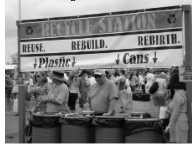
Jazzfest 2008 brings back recycling with Sierra Club Help

TBA – ExComm. Email neworleans-chair@louisiana.sierraclub.org.