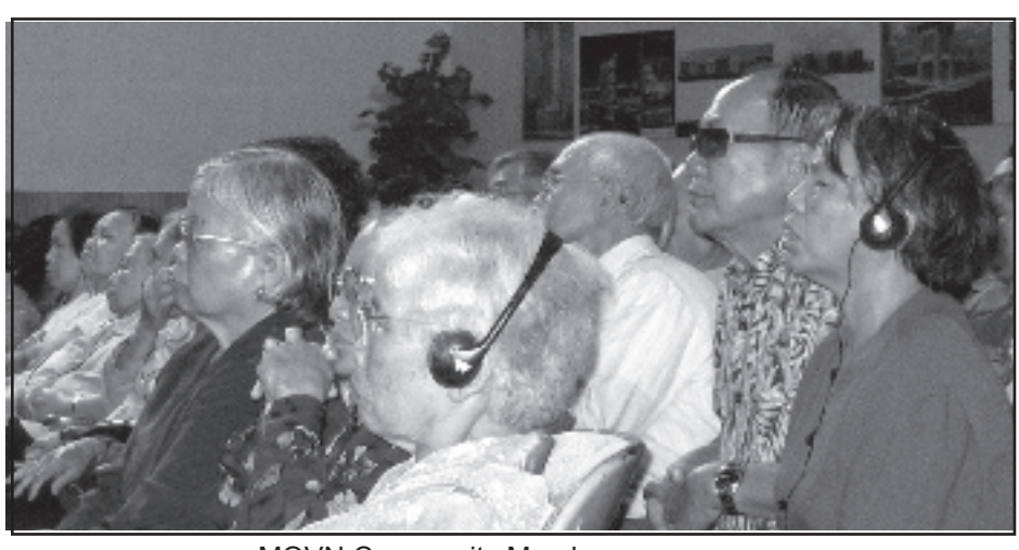
MQVN Community Members

levels of hydrogen sulfide and arsenic into the soil and as well as surface and ground waters.