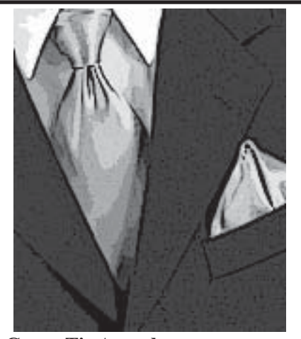
Green Tie Awards See complete list of award winners on web site. www.louisiana.sierraclub.org