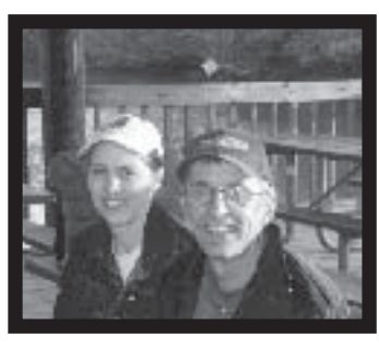
2007 Chapter Retreat at Lake Fausse Point