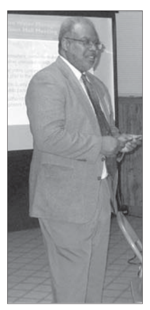
Representative from Southern