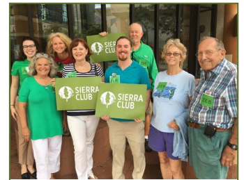
Our Sierra Club volunteers who met in Broward County to support zero-emission buses.

Buses, that is... On June 12, Broward County Commissioners unanimously voted to purchase five zero-emission buses and to purchase an additional ten in the future. This means that Broward County will have more zero-emission electric buses in operation than any other transportation agency in Florida, once these buses are put into operation.