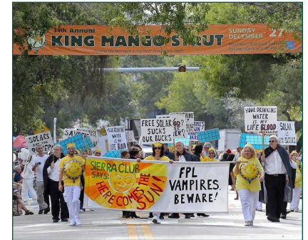
The Sierra Club satirizes FPL "vampires" at the 2015 King Mango Strut in Coconut Grove.

• Also on the state level, is the solar energy debacle whereby the Big Energy Business suddenly sees its Big Profits disappearing on our sunny Florida horizon. Their efforts in trying to promote some form of fees to be levied against solar panel users is abominable. On December 21st there was a major article in the Miami Herald regarding the solar power campaign which states sadly, that this effort (i.e. preventing big energy companies to levy fees on panel users) is fizzling out due to financial disputes among opposing groups. The money is just not there to obtain the additional 400,000 signatures before December 31st, the deadline to get the amendment on the ballot for this coming election year.