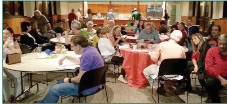
Broward Sierra 2015 Holiday party

Wishing you all a Happy and most healthy New Year from your Broward Sierra Excom. Of all things, health is what's most important. Hopefully, we all got through the Holiday season in decent shape. Perhaps we added a few pounds, but a couple of weeks of salads & veggies will take care of that. Although the Sierra Club does not promote only vegetarianism/veganism, growing veggies takes a LOT less planetary space (and money) than raising cattle for beef consumption!