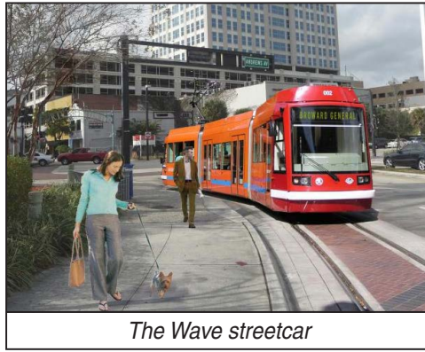
The Wave streetcar