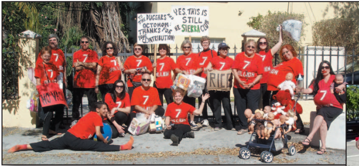
The King Mango Strutters, December, 2011