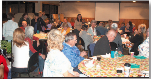
Holiday Party, December, 2011