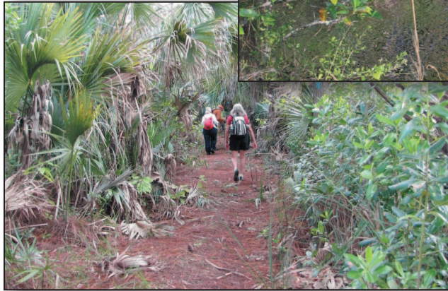
Big Cypress Hike November, 2011