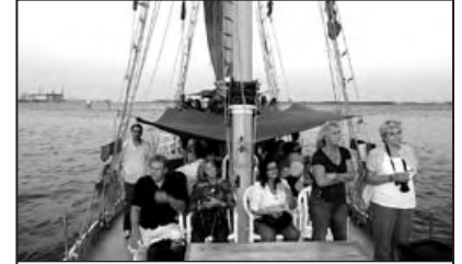
Sierrans on the Tall Ship in 2008.

At press time, there were no other outings scheduled for April or May. So please keep an eye on our website for newly scheduled outings. (Click on "Outings and Events" at http://florida.sierraclub.org/broward )