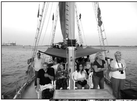
Sierrans on the Tall Ship in 2008.