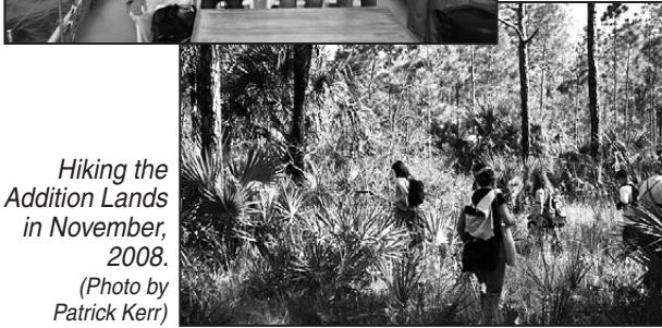
Hiking the Addition Lands in November, 2008.