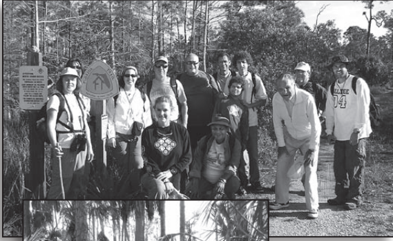
March 3, 2008 Big Cypress Hike