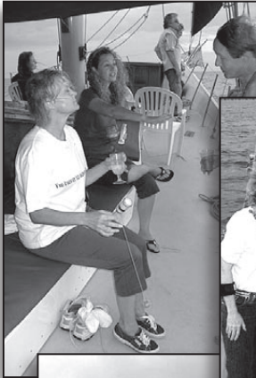
2007 Tall Ship Cruise