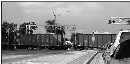
Florida East Coast Railroad cars filled with crushed limestone from the Everglades cross Broward Blvd. in downtown Ft. Lauderdale.

Unfortunately, any celebrating of the judge's ruling was premature. The millions of tons of limestone which are mined annually in the Lake Belt District just outside of Everglades National Park are a significant percentage of the state's total, and are used throughout Florida as roadbed material as well as being the major ingredient in concrete. Mined limestone is an absolutely essential ingredient in the growth and sprawl we have all seen.