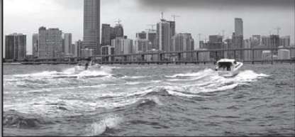
2005 Tall Ship Cruise