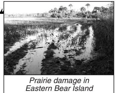
Prairie damage in Eastern Bear Island

not consistent with either the letter or the spirit of the management plan.