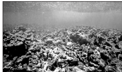
Carysfort Reef 1985