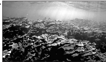
Carysfort Reef 1975