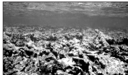
Carysfort Reef 1995