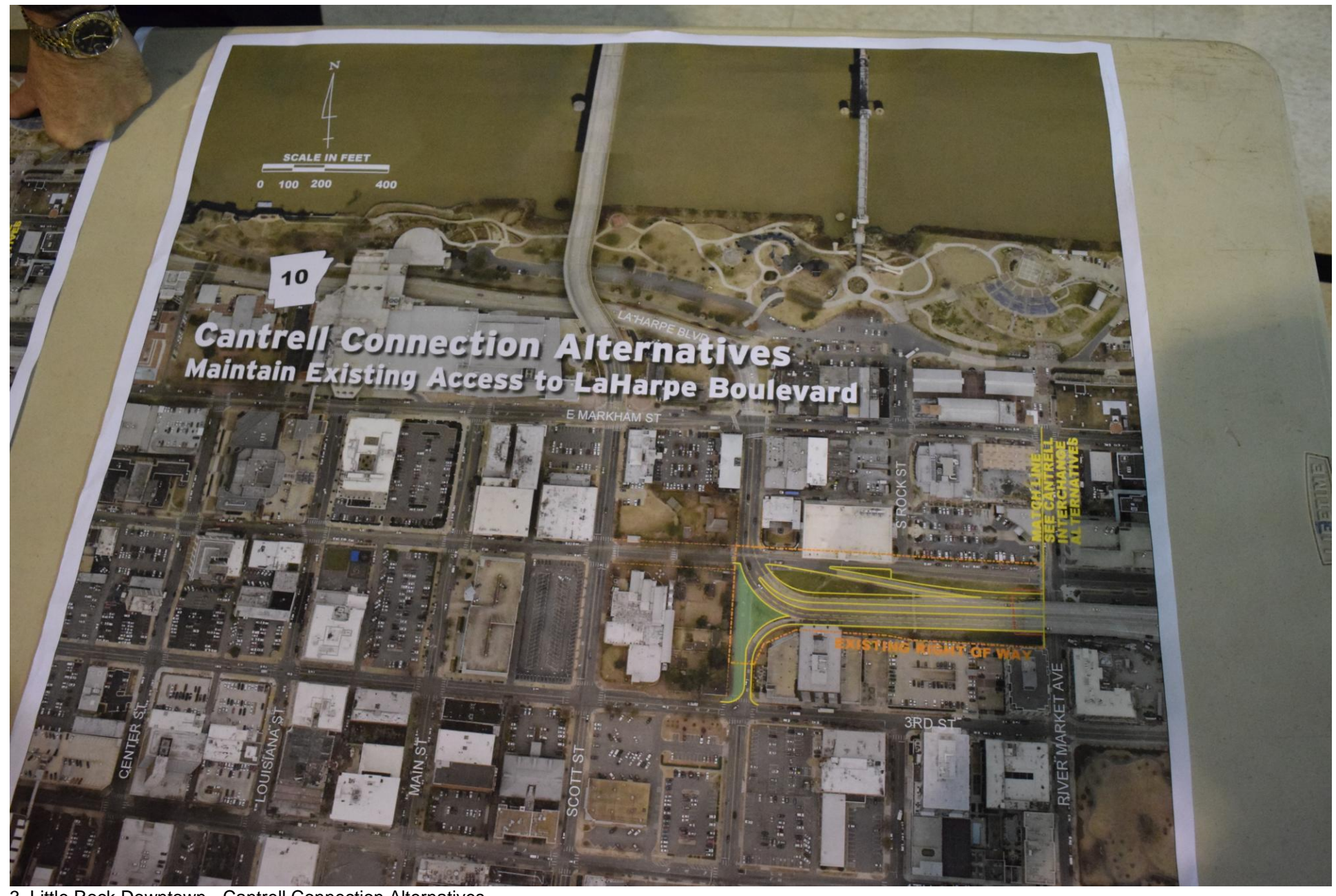
3. Little Rock Downtown - Cantrell Connection Alternatives