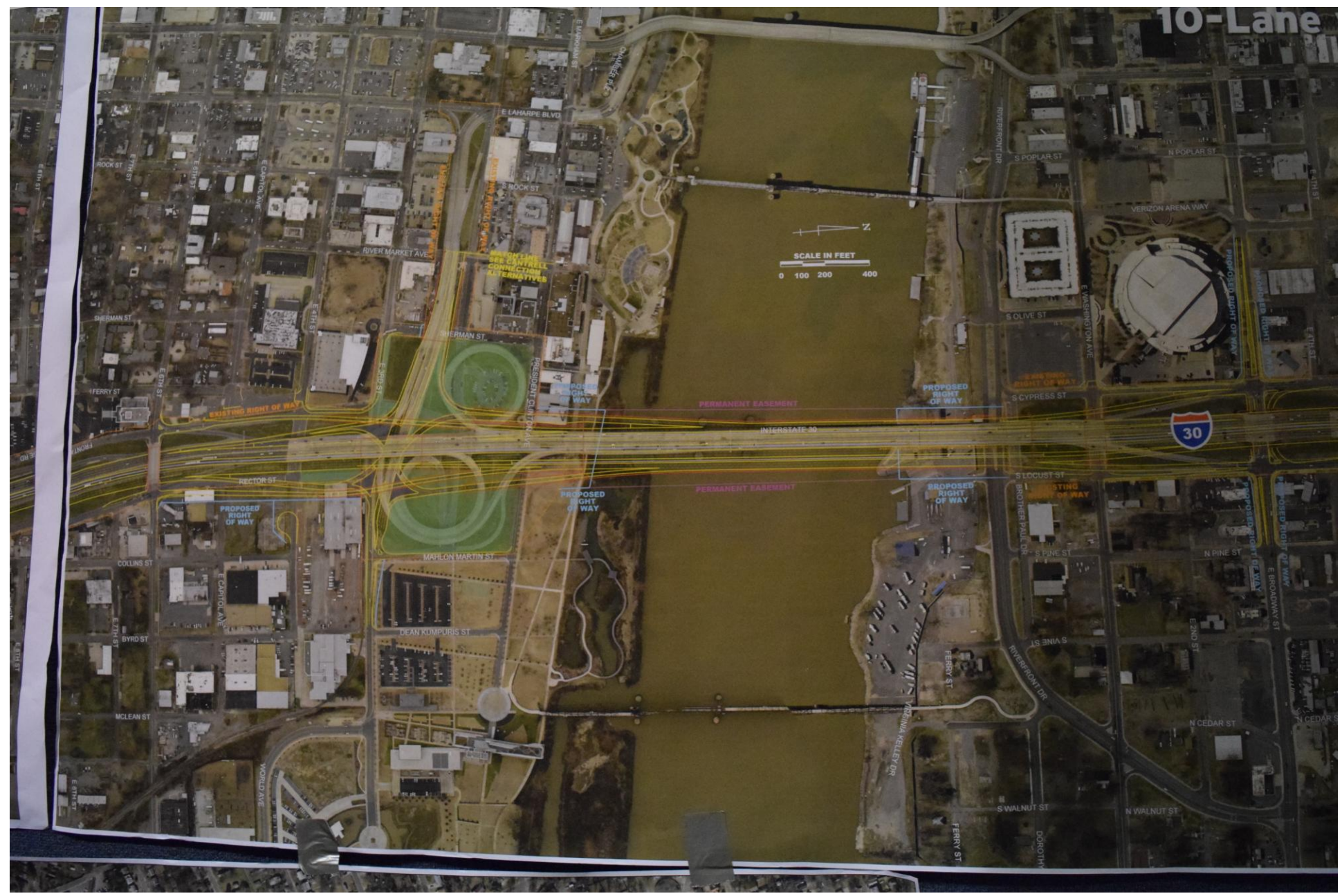
1. Downtown Little Rock Interchange - Arkansas River from River Market to Clinton Library