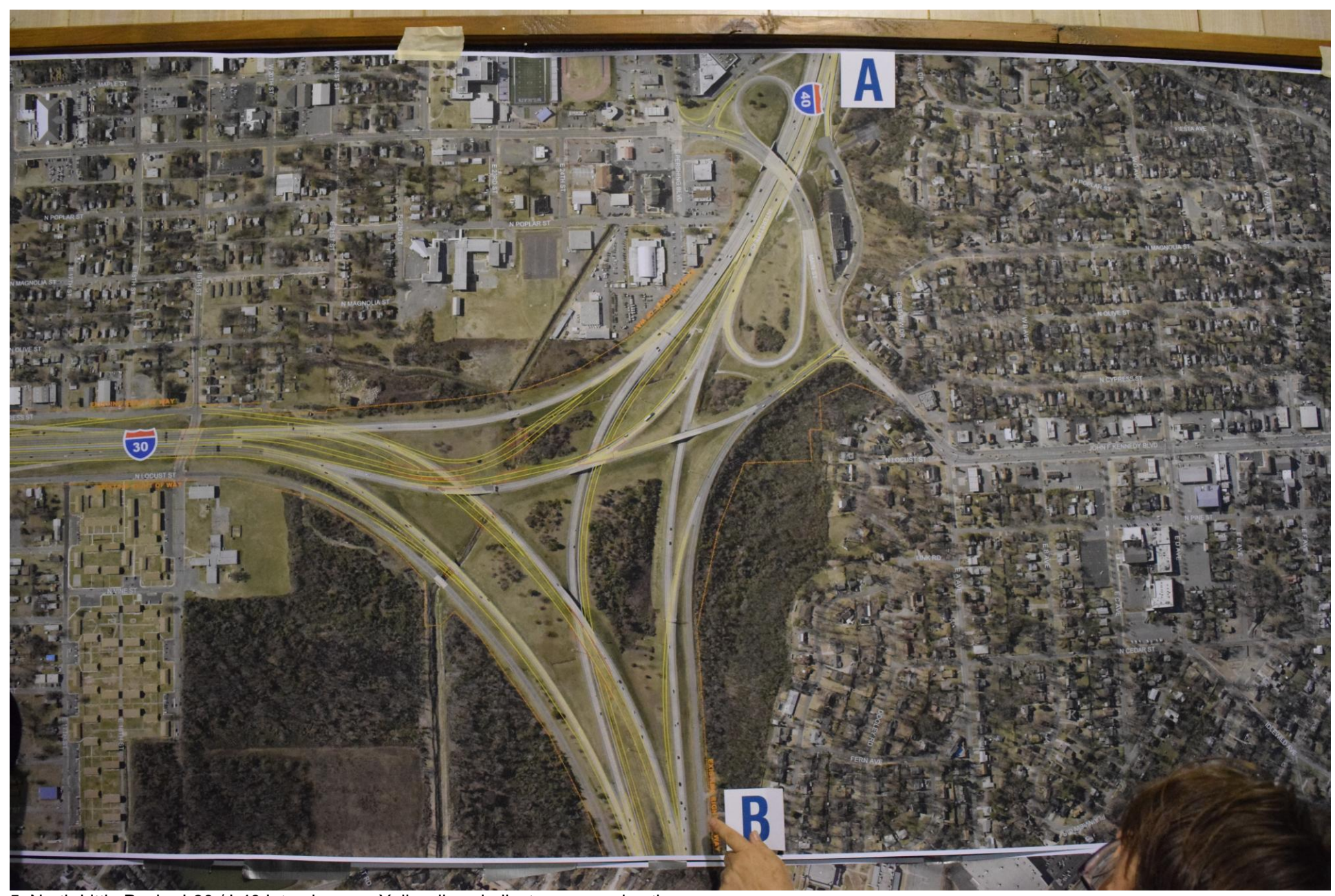
5. North Little Rock - I-30 / I-40 Interchange - Yellow lines indicate proposed path