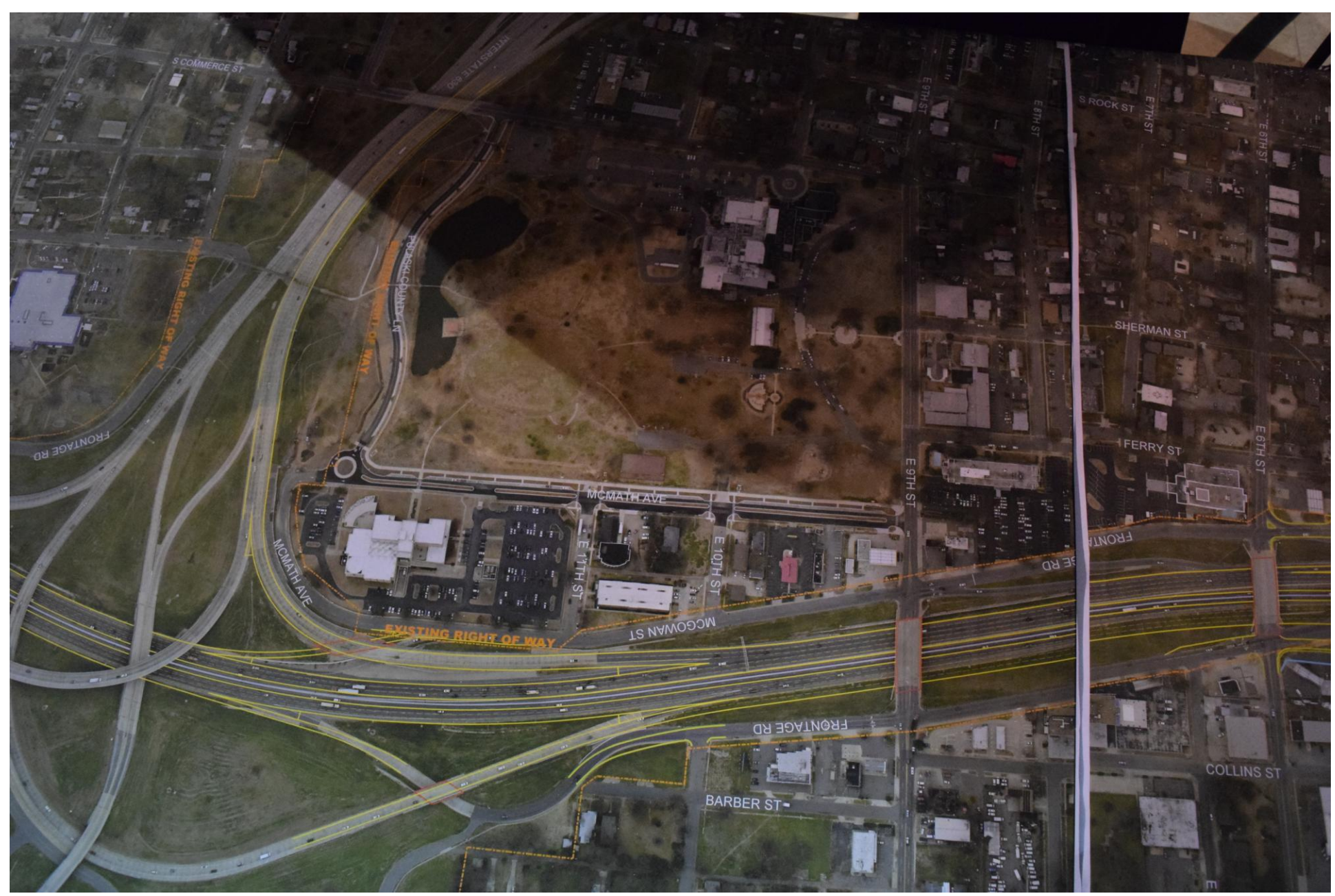
4. Little Rock - South Interchange (west of airport)