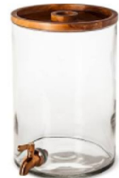
Glass Beverage Dispenser 2 gal - Threshold, Clear