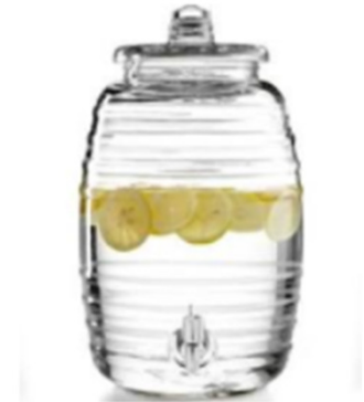
The Cellar 2.5-Gallon Barrel Beverage Dispenser, Created for Macy ...