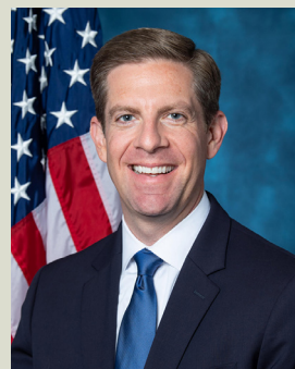
Hon. Mike Levin

Please plan join us via Zoom as we welcome Mike Levin on Tuesday, May 25 at 7:00 p.m.