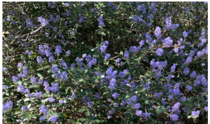
That is John Kaiser in the top picture. The purple flowers are Ceanothus.