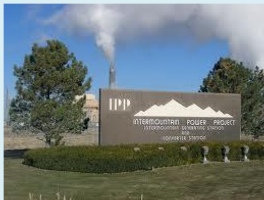
L.A.'s coal-fired plant in Utah