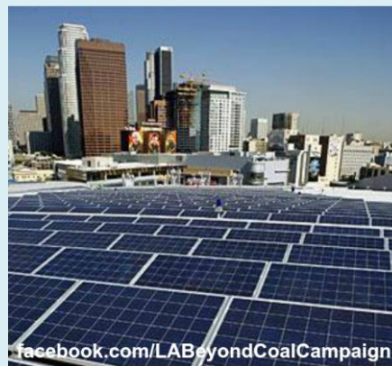
Renewables such as solar In L.A.'s future

The left hand pictures shows where much of our power comes from, which is from coal fired plants in Utah and Arizona. Notice the emissions coming from the smoke stack, which can only hurt our fantastic national parks in both those states. The right hand picture represents a cleaner future by going with solar instead.