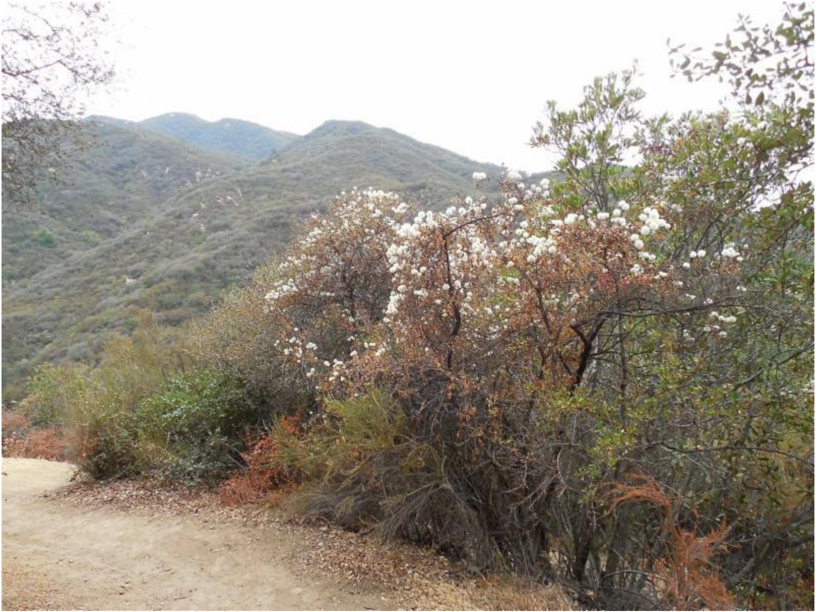
Tues, Feb. 4, 2014 Newton Canyon hike See write-up in Tues. activities below: