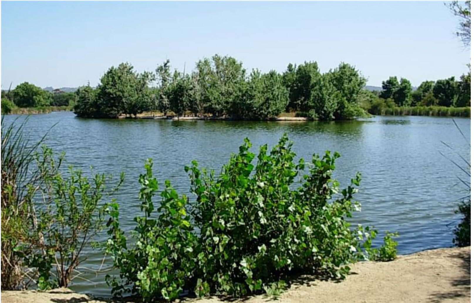
Sun., Feb. 23, 2014 Sepulveda Basin hike See write-up in Sunday activities below