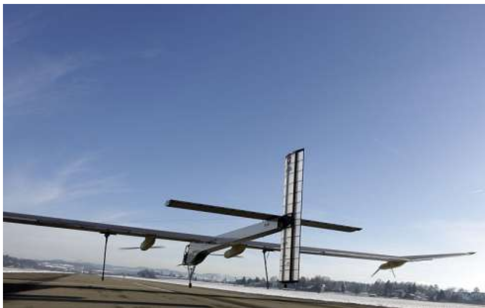
Solar impulse solar plane picture is from Wikipedia

http://www.caiso.com/about/Pages/News/Default.aspx