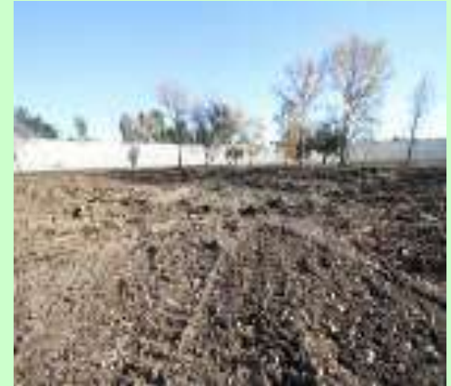
Wild Life Area Pond Dec. 2012 after habitat destruction