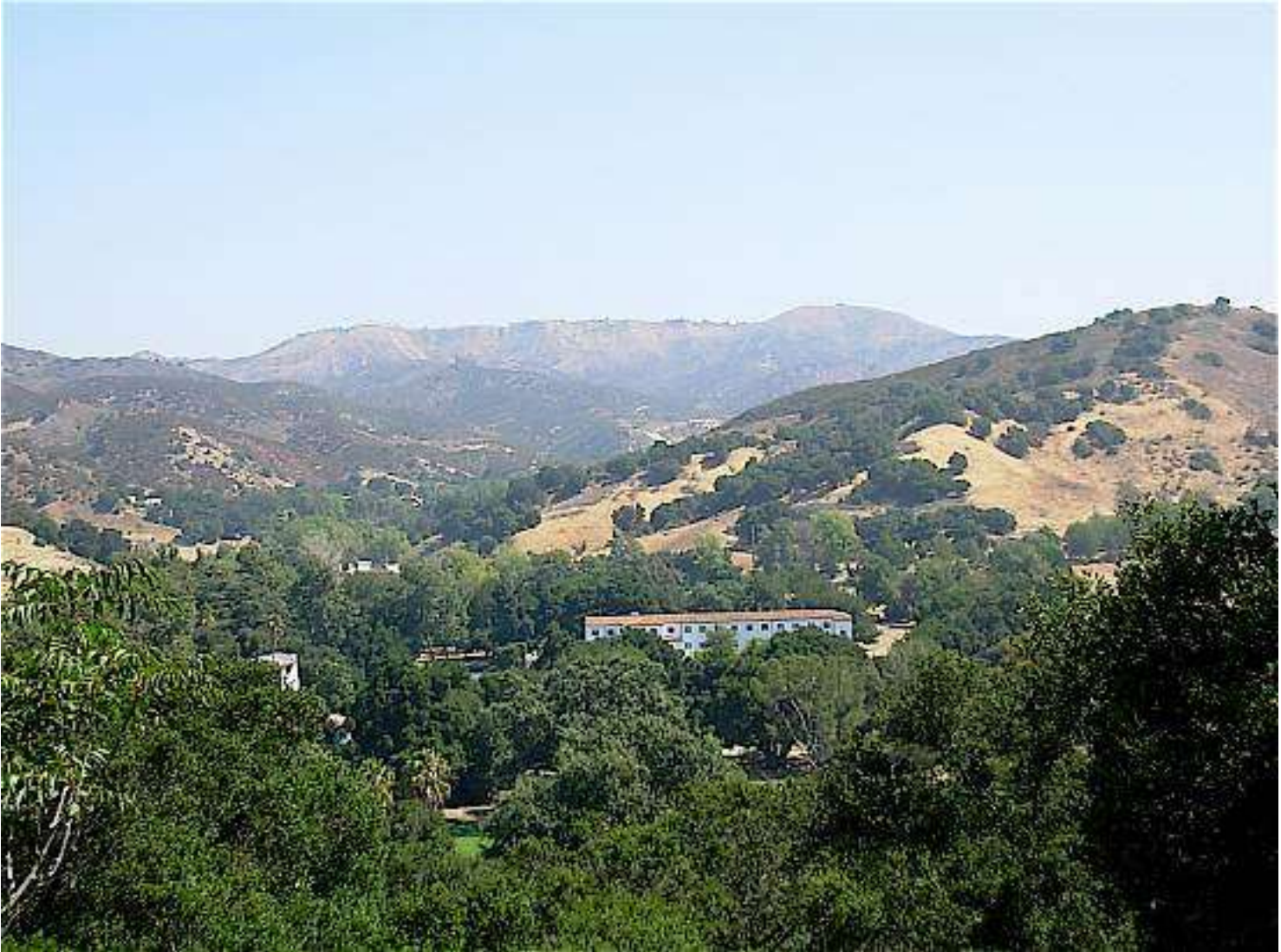
King Gillette Ranch See write-up on activities below