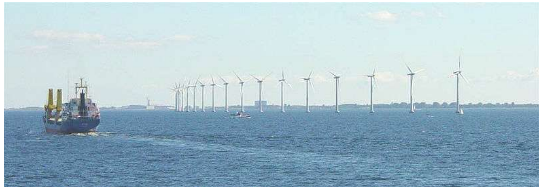
Offshore wind turbines near Copenhagen, Denmark