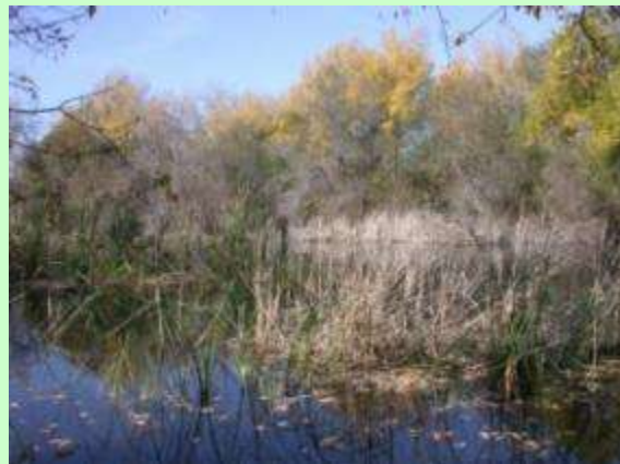
South Wild Life Area Pond 2010 Before habitat destruction