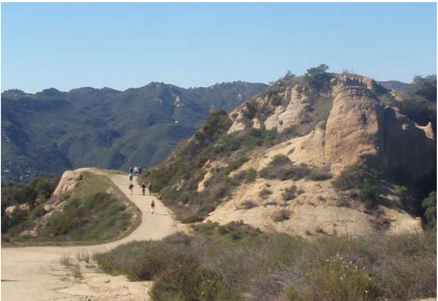
Aug 15, 2013 Trippet Ranch, Musch Trail, Eagle Rock Loop See write-up below

O: (WA) Moderately paced 5 mile, 800' gain hike up and down a chaparral canyon, with a wonderful viewpoint of the WLA and the Pacific Ocean, then by a lake in the midst of Beverly Hills. Meet 8:00 AM at Franklin Park/Ranch parking lot. From 101 Fwy take Coldwater Canyon south 2 1/2 miles where it crosses Mulholland Drive West. Make a 90° turn onto Franklin Canyon Drive (sign reads Road Closed 800 yrds) and enter park. Pass upper parking lot at nature center, continue veering right around lake. Turn right at stop sign at bottom of lake, drive 1 mile and veer left on Lake Drive. Warning: Stop at camera monitored stop signs in park or you will be ticketed. Follow to end and park. Rain cancels. Leader: PIXIE KLEMIC Asst: TBD