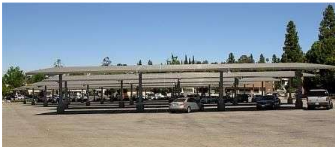
Solar awnings for parking at Taft High School in San Fernando Valley