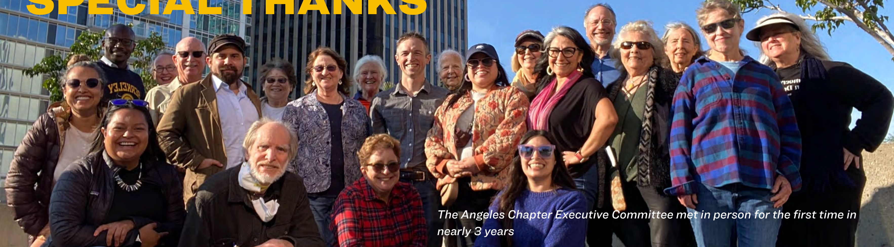
The Angeles Chapter Executive Committee met in person for the first time in nearly 3 years

Thank you for being part of a strong year of exploring, enjoying and protecting the planet. As I approach three years as Chapter Director, I reflect on how far we've come. From the depths of the pandemic and the pain of the Black Lives Matter Uprising, to historic victories for justice and conservation, I'm honored to be part of this team. Our outings program is back in gear and growing, our chapter staff is expanding, and our chapter leadership is diversifying.