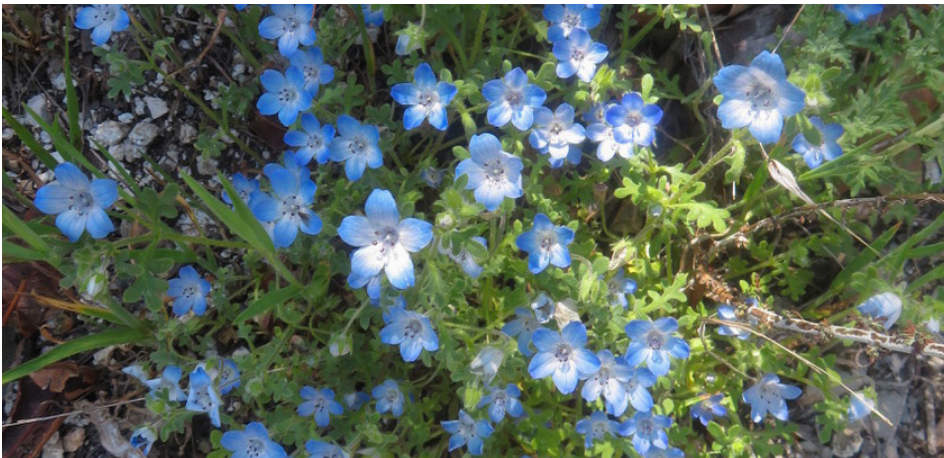
Blue flowers - Baby blue eyes