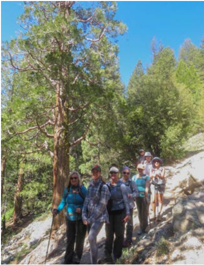
Heading down from Buckhorn Camp

Well, the brilliant inspiration back when the Wild Wet Winter of 2019 was just starting to show how wet it might be was: hey, it would be fun to see lots of water flowing in the streams below Buckhorn Campground. The outing could even include a little boulder hopping along Little Rock Creek. Of course, when I scheduled the outing for