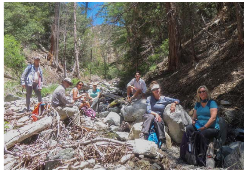
Waiting for fruit salad on the Burkhart Trail