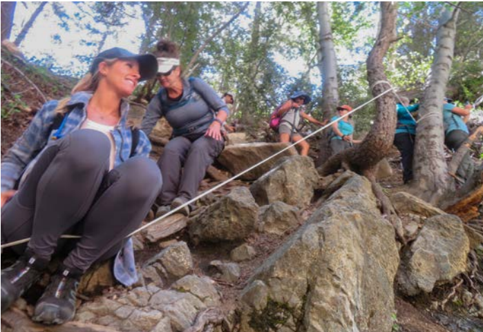
Descent to the waterfall

June 8, I didn't know how wet this season would turn out to be. As it turned out, upon reaching Little Rock Creek, it quickly became apparent there was so much water that