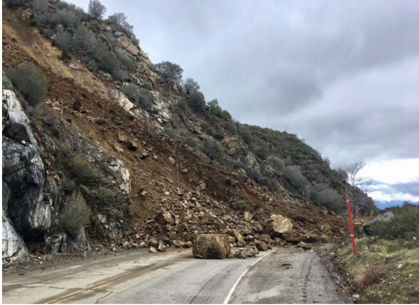
Landslide on Hwy. 2, February 15, 2019

Check SR 2 road conditions: https://roads.dot.ca.gov