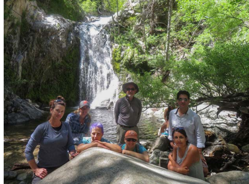
Cooper Canyon waterfall

Whether the final mileage, instead of being the advertised 5 miles, was 6, 8, or 20 miles was a point of discussion back at the trailhead. But I think all concerned enjoyed the day. ■