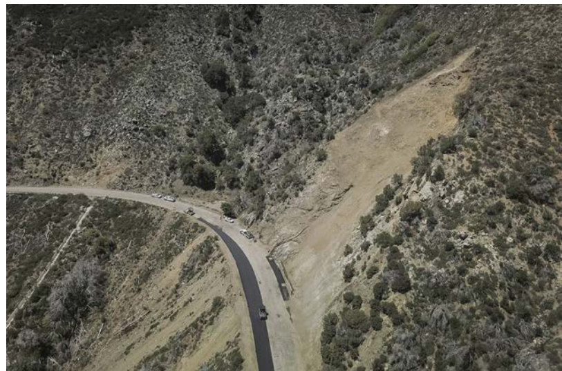
Landslide removal with widened road