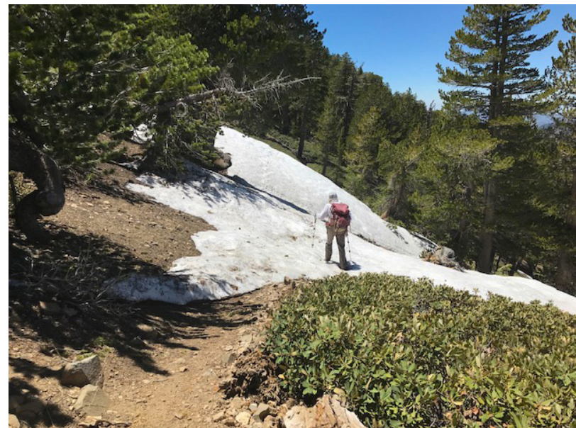
June 12 - Still snow on trail to Dawson Saddle

Moderately paced 8 mile 1200 gain hike in Topanga State Park. Meet 8:30 AM at Trippet Ranch parking lot (from 101 Ventura Fwy take Topanga Canyon Blvd, exit 27, south to Entrada Rd, turn left (east), go about one mile making two left turns to stay on Entrada Rd, and park along Entrada Rd outside lot or pay to park in lot). Bring $ for parking, 2 quarts water, lunch, sturdy hiking footwear, hat, sunscreen. Rain cancels. Leaders: Ted Mattock, Diane DeMarco ■