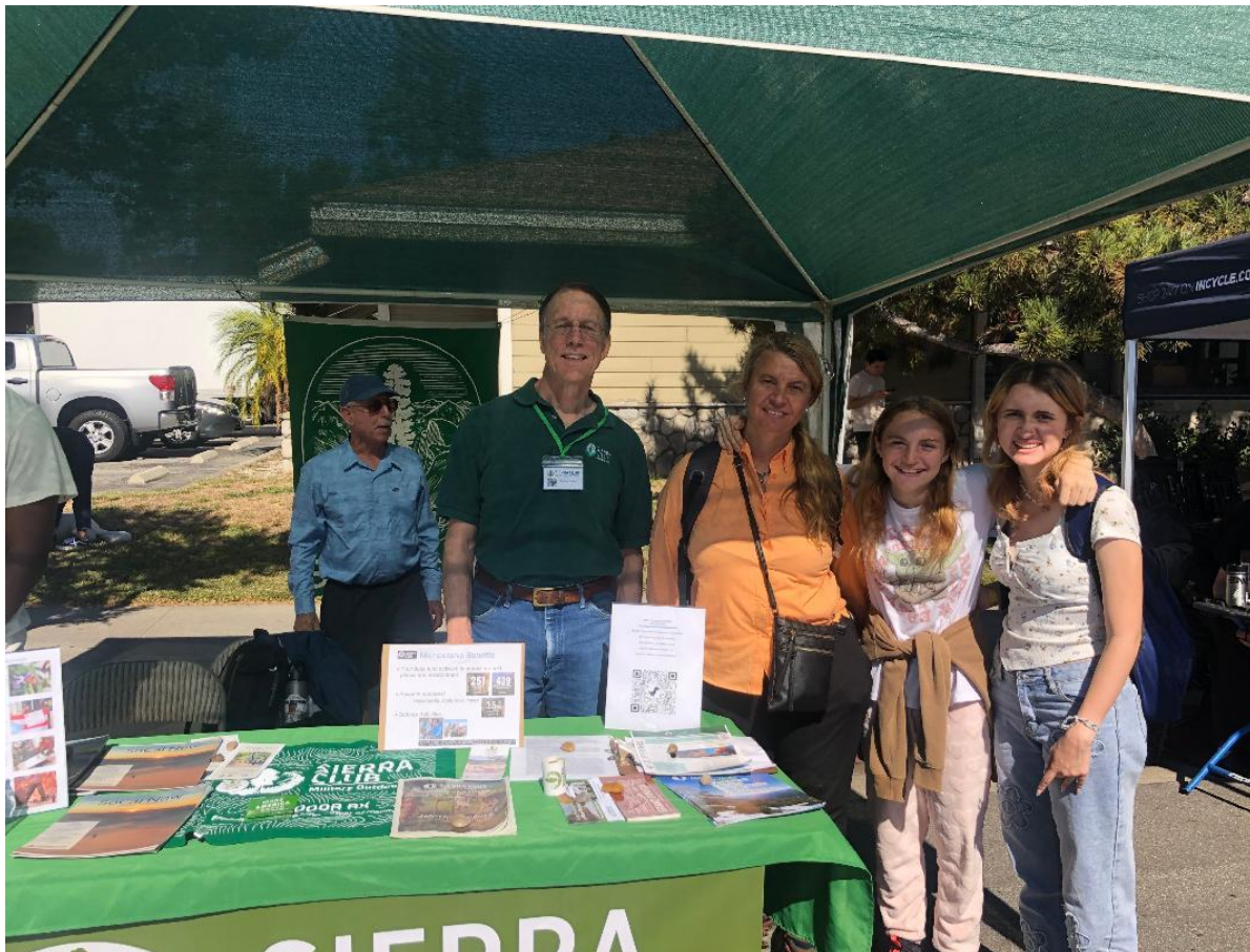
Members of the Crescenta and Pasadena groups table at the Arroyo Fest held in Pasadena on October 29 th , 2023.