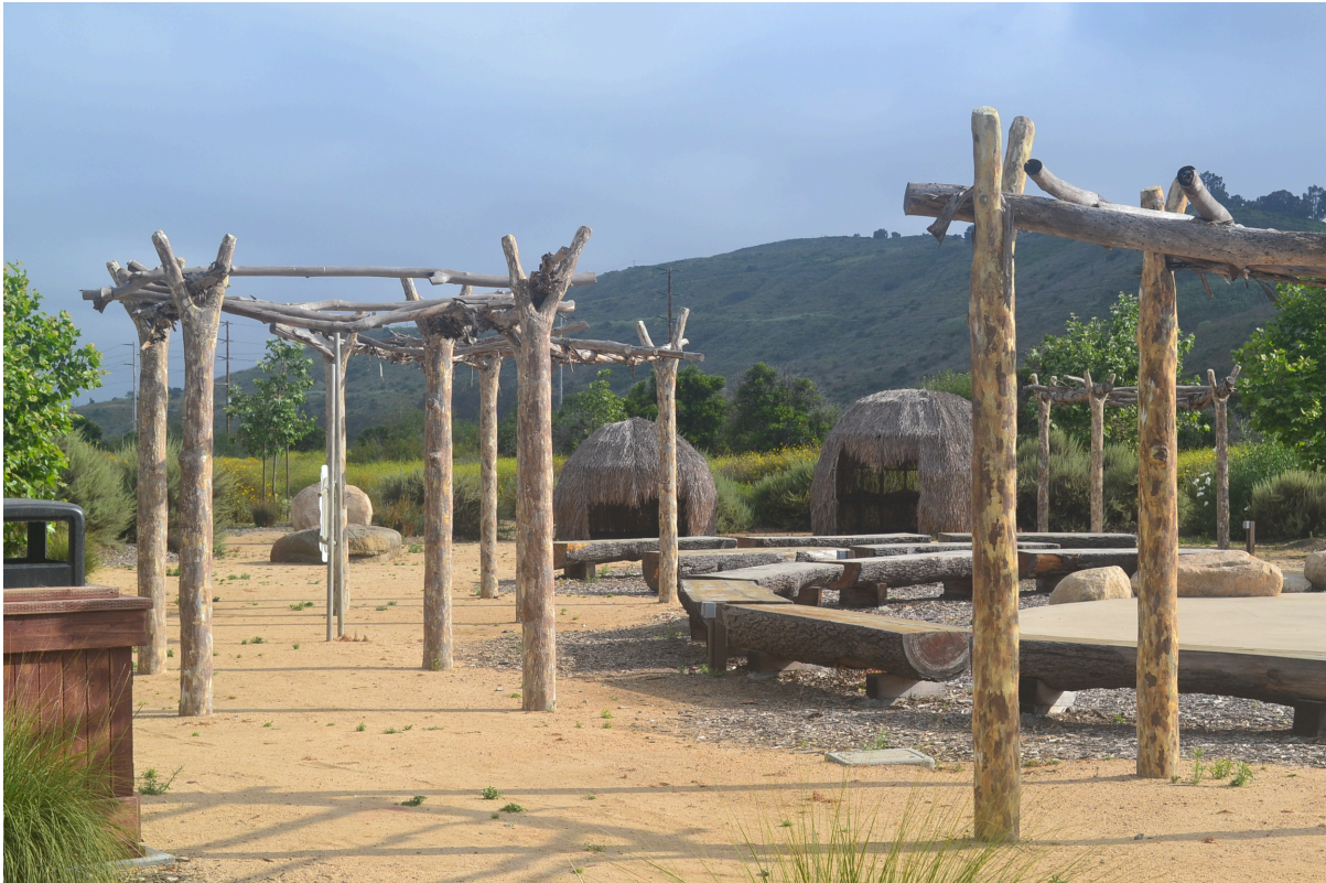
Putuidem Village