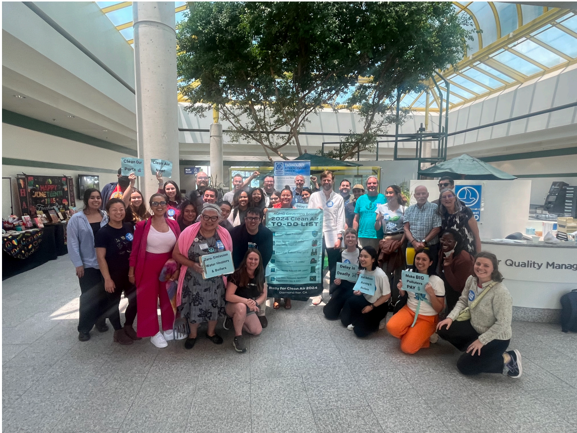
Climate activists celebrating their victory at SCAQMD.