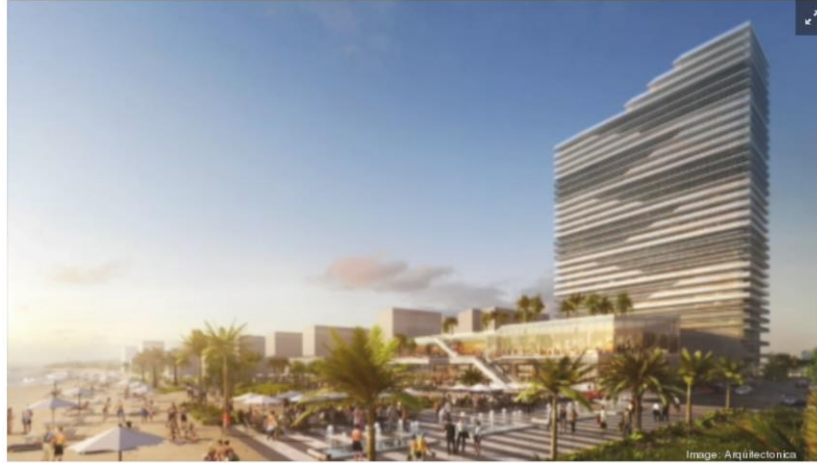
Related Group wants to build a multifamily building at 1301 S. Ocean Drive in Hollywood. ARQUITECTONICA